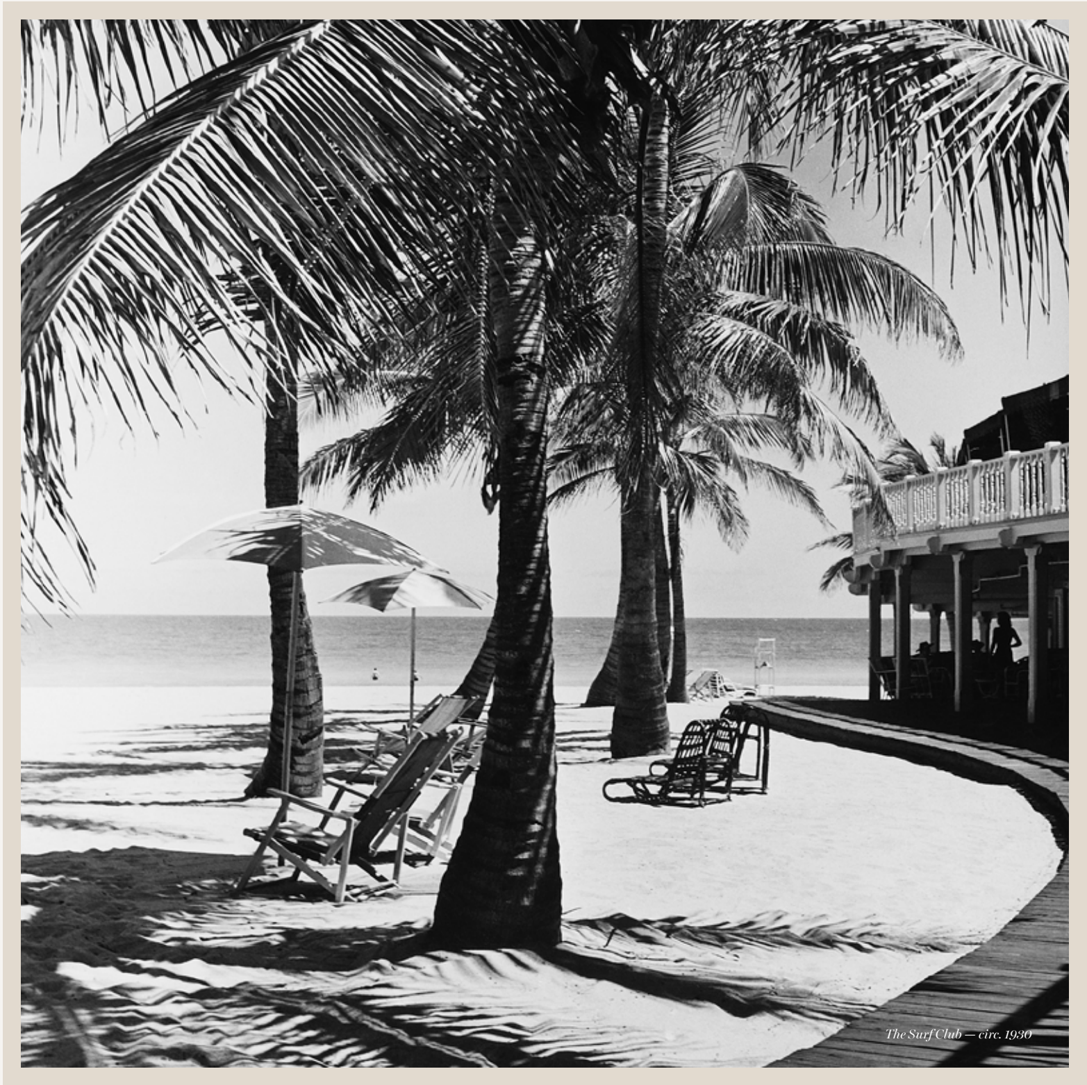
The Surf Club — circ. 1930