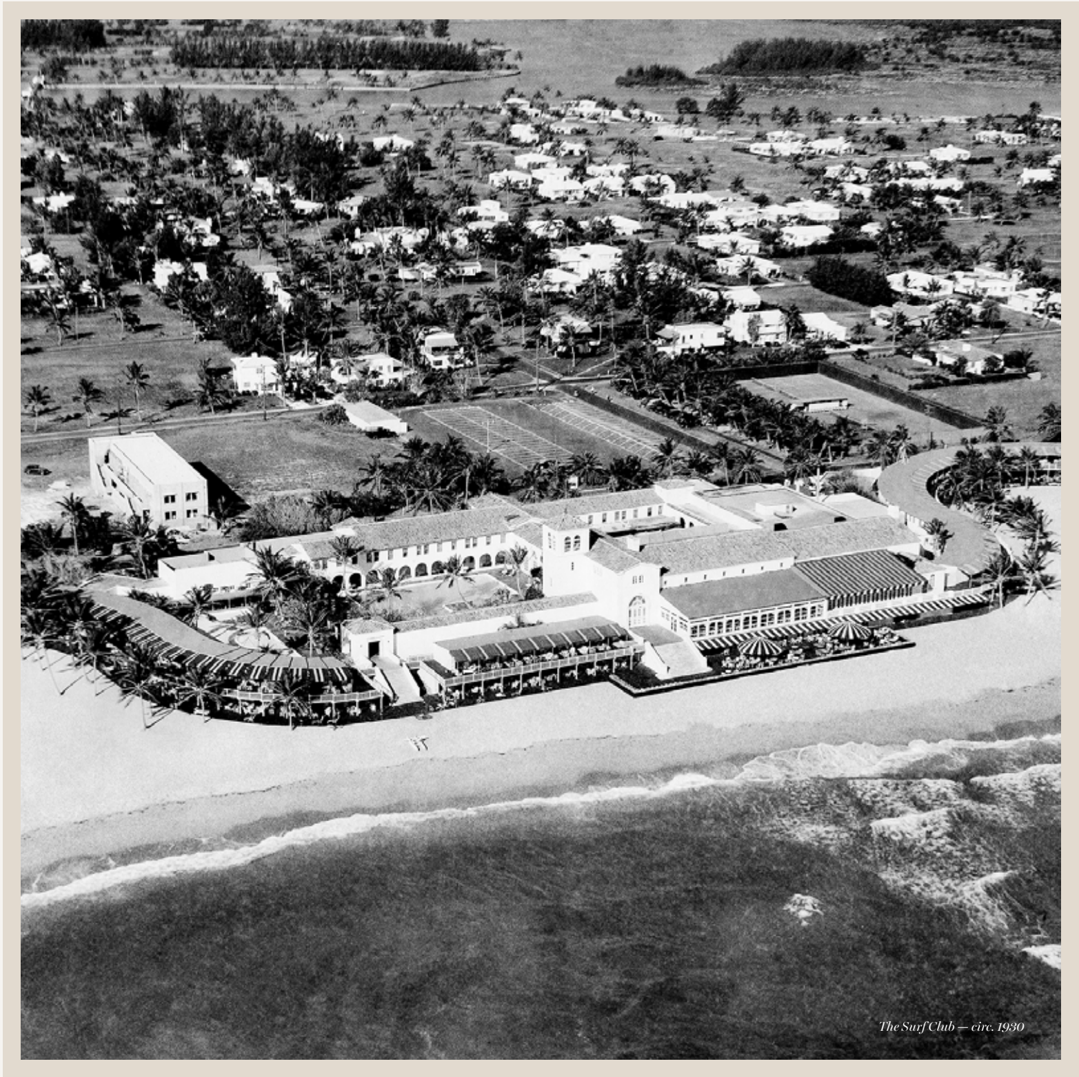
The Surf Club — circ. 1930