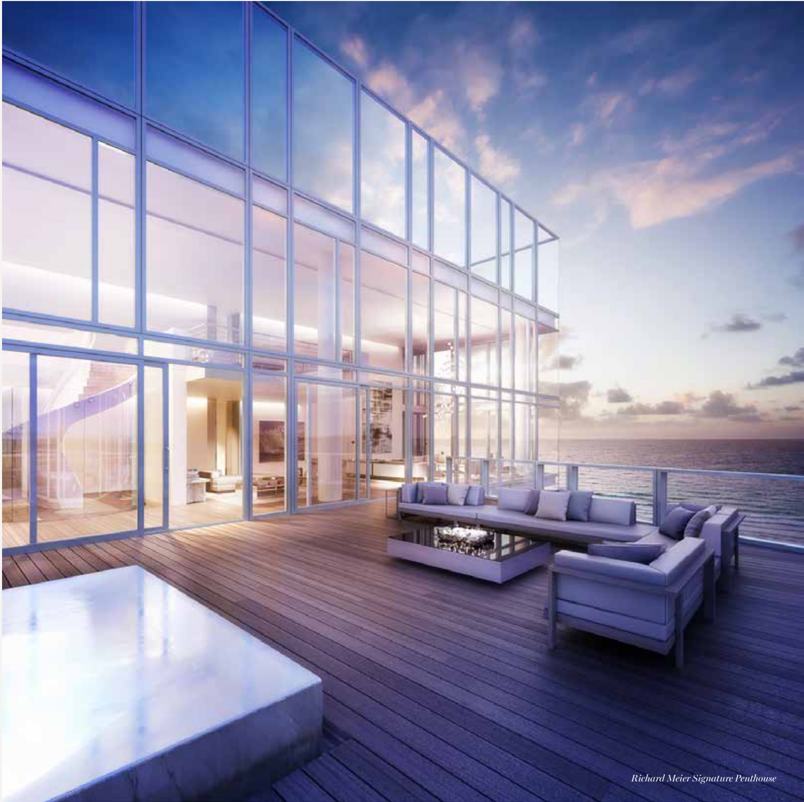
Richard Meier Signature Penthouse