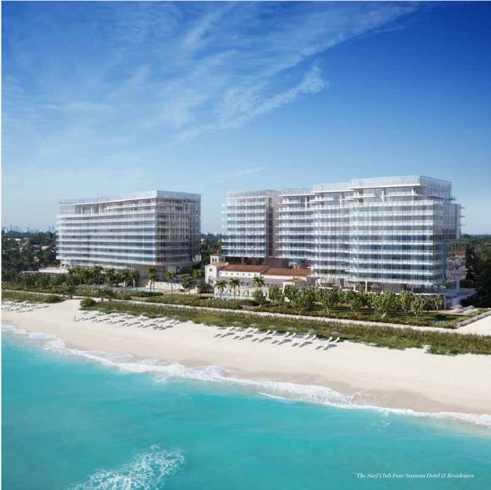
The Surf Club Four Seasons Hotel & Residences