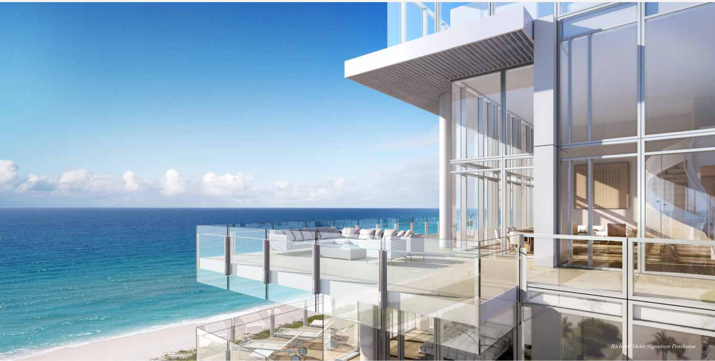
Richard Meier Signature Penthouse