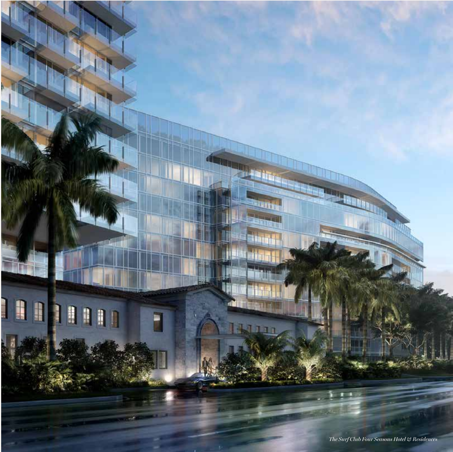
The Surf Club Four Seasons Hotel & Residences