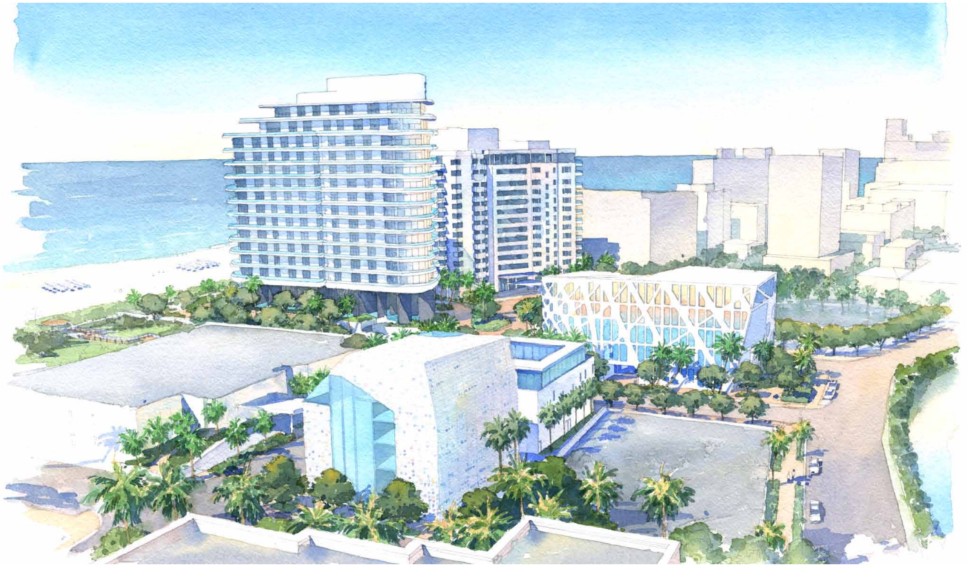
Looking south towards Faena District. Artist Rendering.