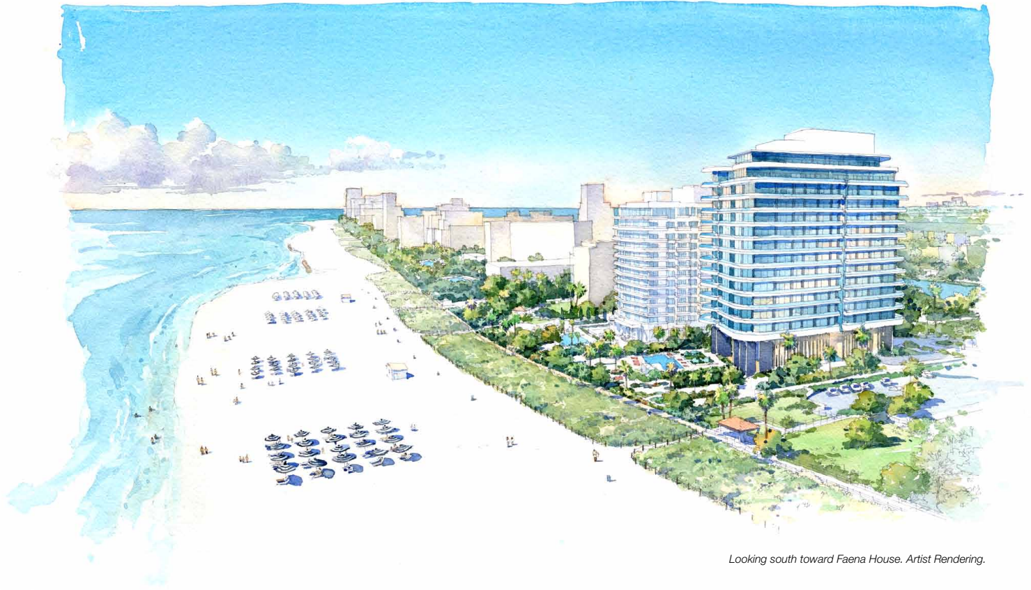
Looking south toward Faena House. Artist Rendering.