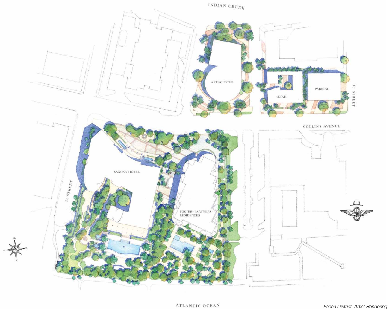
Faena District. Artist Rendering.