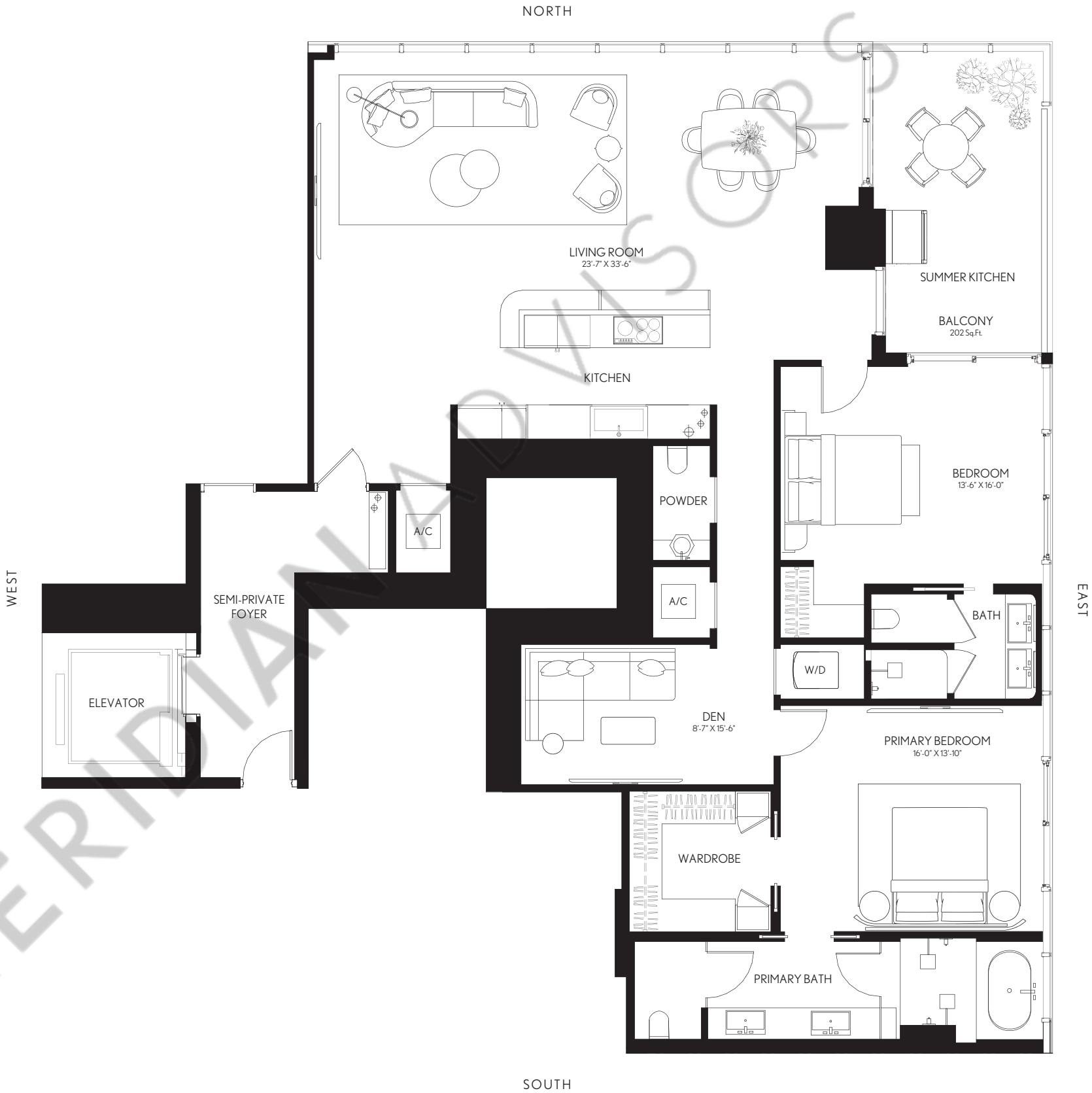
WALDORF ASTORIA RESIDENCES MIAMI

WALDORF ASTORIA IS A REGISTERED TRADEMARK OF HILTON INTERNATIONAL HOLDING LLC, AN AFFILIATE OF HILTON WORLDWIDE HOLDINGS INC. ("HILTON"). THE RESIDENCES ARE NOT OWNED, DEVELOPED, OR SOLD BY HILTON AND HILTON DOES NOT MAKE ANY REPRESENTATIONS, WARRANTIES OR GUARANTIES WHATSOEVER WITH RESPECT TO THE RESIDENCES. THE DEVELOPER USES THE WALDORF ASTORIA BRAND NAME AND CERTAIN WALDORF ASTORIA TRADEMARKS (THE "TRADEMARKS") UNDER A LIMITED AND NONEXCLUSIVE LICENSE FROM HILTON. THE LICENSE MAY BE TERMINATED OR MAY EXPIRE WITHOUT RENEWAL, IN WHICH CASE THE RESIDENCES WILL NOT BE IDENTIFIED AS A WALDORF ASTORIA BRANDED PROJECT OR HAVE ANY RIGHTS TO USE THE TRADEMARKS.