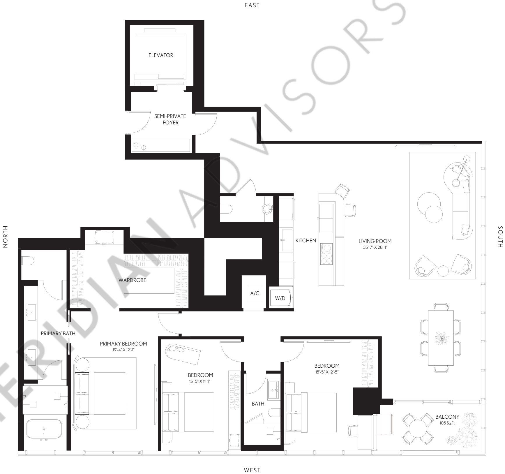
WALDORF ASTORIA RESIDENCES MIAMI

WALDORF ASTORIA IS A REGISTERED TRADEMARK OF HILTON INTERNATIONAL HOLDING LLC, AN AFFILIATE OF HILTON WORLDWIDE HOLDINGS INC. ("HILTON"). THE RESIDENCES ARE NOT OWNED, DEVELOPED, OR SOLD BY HILTON AND HILTON DOES NOT MAKE ANY REPRESENTATIONS, WARRANTIES OR GUARANTIES WHATSOEVER WITH RESPECT TO THE RESIDENCES. THE DEVELOPER USES THE WALDORF ASTORIA BRAND NAME AND CERTAIN WALDORF ASTORIA TRADEMARKS (THE "TRADEMARKS") UNDER A LIMITED AND NONEXCLUSIVE LICENSE FROM HILTON. THE LICENSE MAY BE TERMINATED OR MAY EXPIRE WITHOUT RENEWAL, IN WHICH CASE THE RESIDENCES WILL NOT BE IDENTIFIED AS A WALDORF ASTORIA BRANDED PROJECT OR HAVE ANY RIGHTS TO USE THE TRADEMARKS.