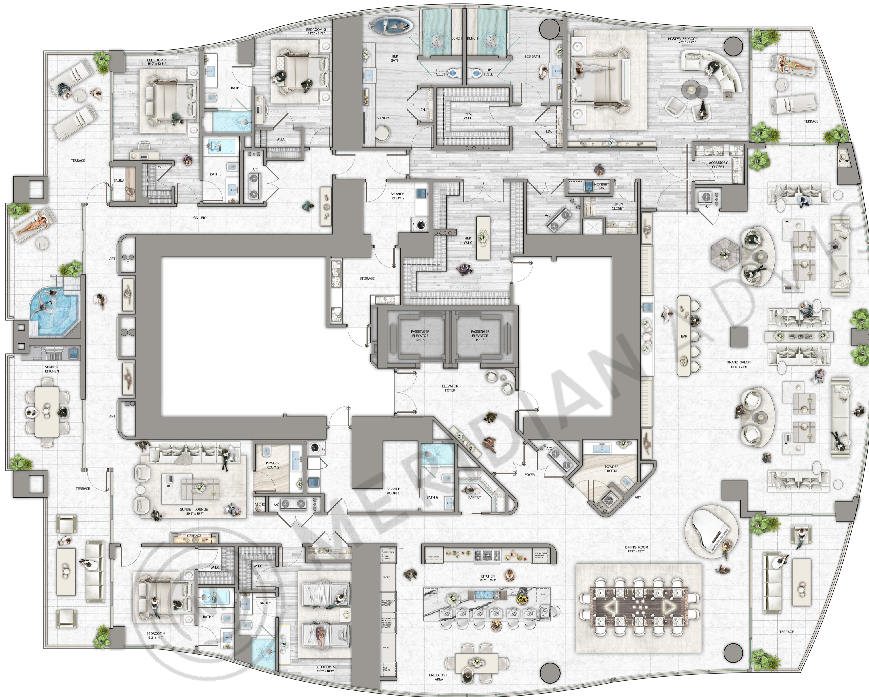
NORTH TOWER - PORTOFINO FLOOR PLAN